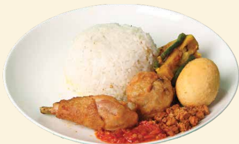
Kapau Rice with Chicken