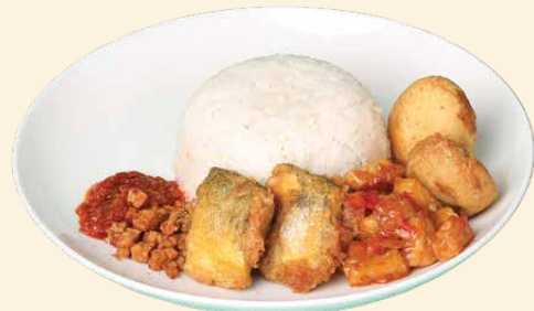
Milkfish with Stir-Fry Tofu