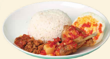
Spicy Indonesian Chicken