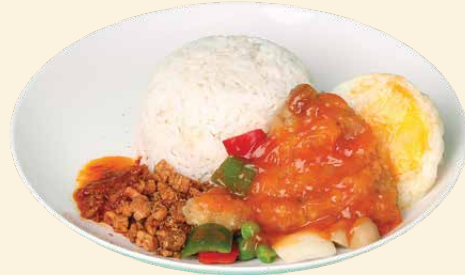
Sweet and Sour Chicken

With abundance of variants, Makan Ku is ready to give you the authentic taste of Indonesia.