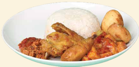
Chicken with Stir-Fry Tofu