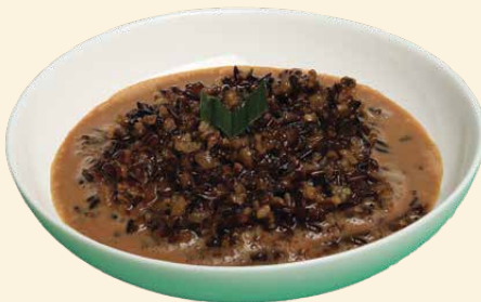
Black Sticky Rice Porridge