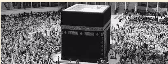
Hajj and Umra