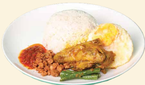
Manado Chicken Woku