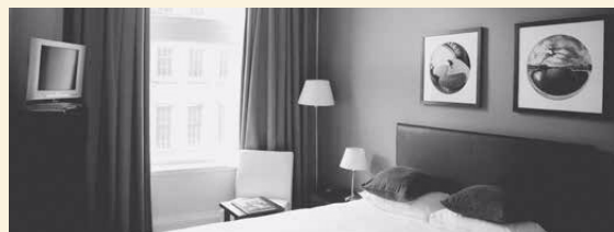
Hotels, Cafeteria and Canteen