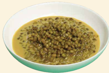
Green Beans Porridge