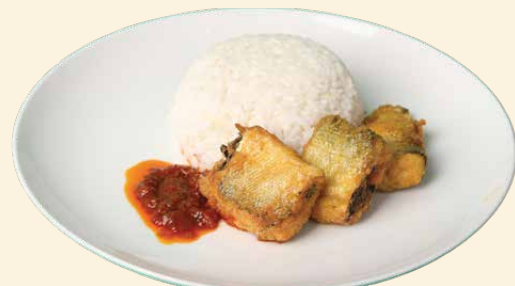
Milkfish with Rice