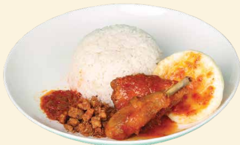
Padang Chicken Sauce