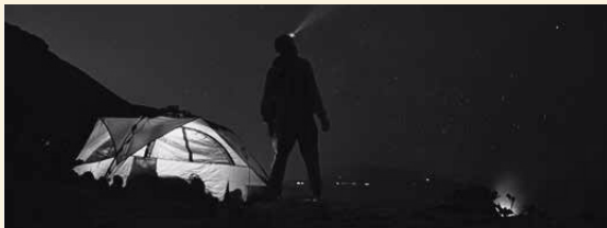
Camping and Outdoor Activities

With the existence of long shelf life, room temperature product and could be cooked without the presence of electricity or fire (in one of our series), Makan Ku could be a credible solution to different kinds of activities such as: