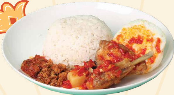
Indonesian Spicy Chicken