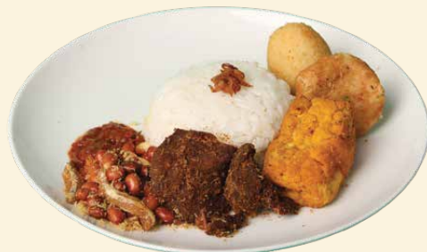
Indonesian Rice Cooked with Coconut Milk with Empal