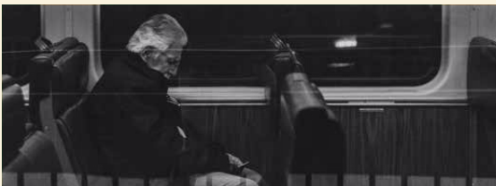
Public Modes of Transportation