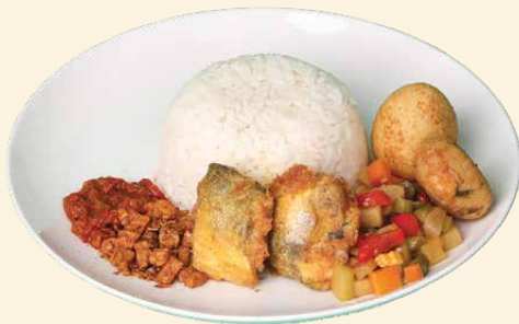
Milkfish with Vegetables