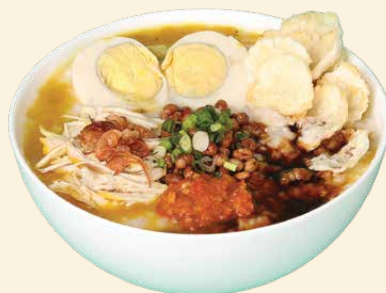
Sukabumi Signature Porridge