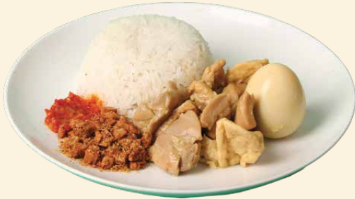
Chicken Braised in Coconut Milk