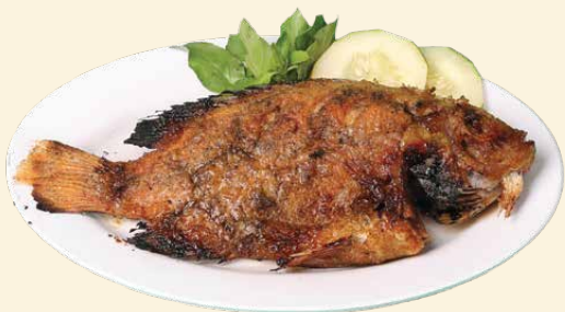
Grilled Nile Tilapia