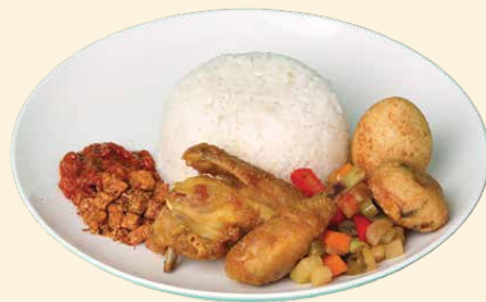
Chicken with Vegetables