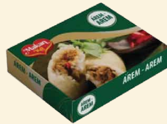
Arem – Arem