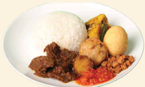
Kapau Rice with Beef Rendang