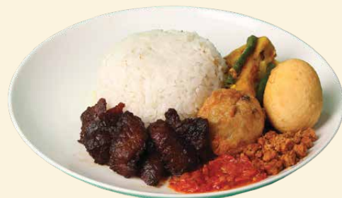
Kapau Rice with Jerked Meat