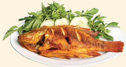
Fried Nile Tilapia