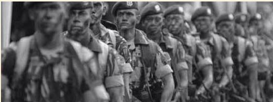
Consumption of Military and Police Task Force